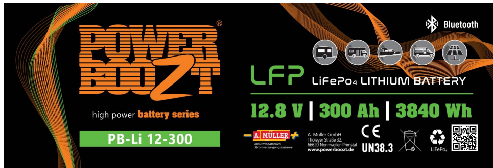
Figure 4 Battery label (电池标签)