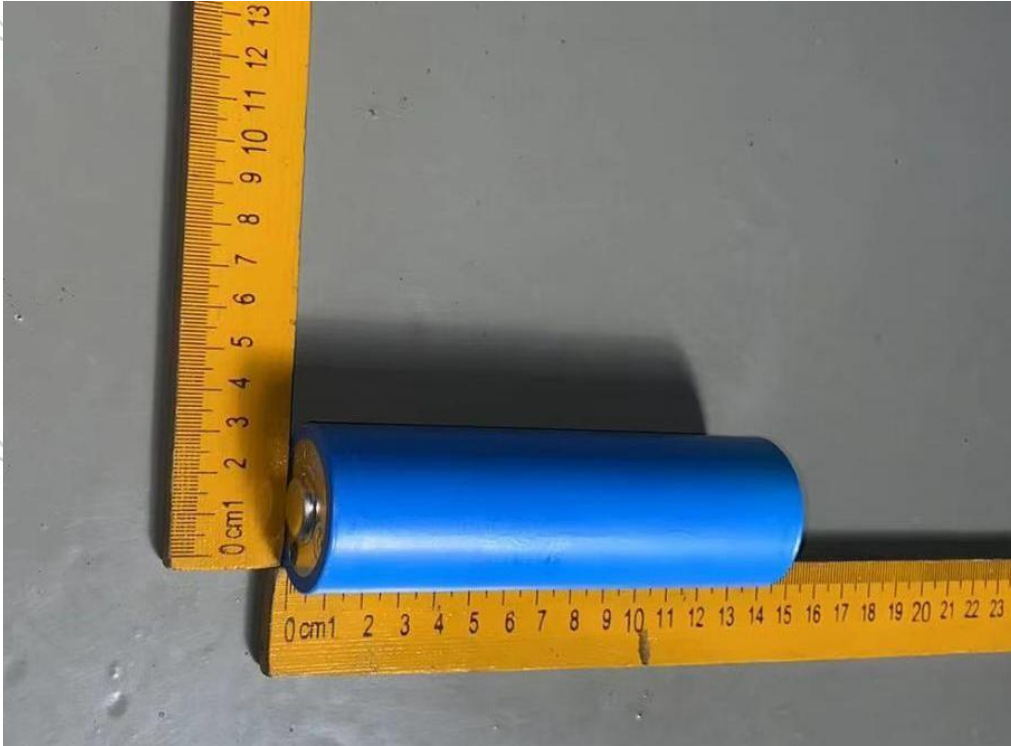
Figure 3 Overall view of cell (电芯图)