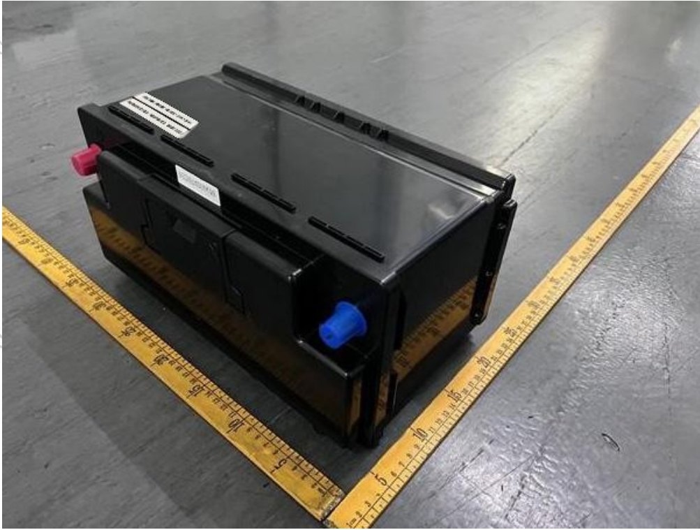
Figure 1 Overall view I of battery (外观图I)