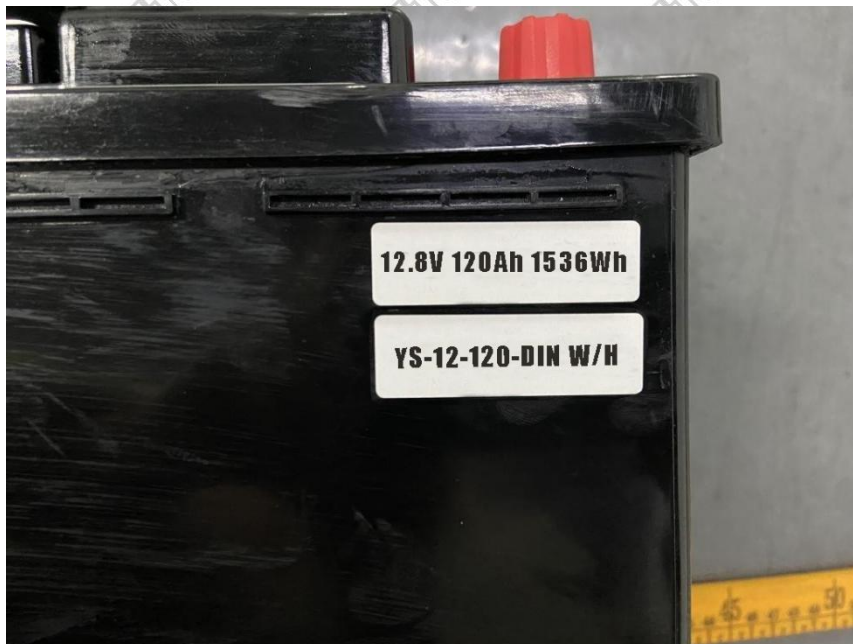
Figure 4 Battery Label (电池标签)