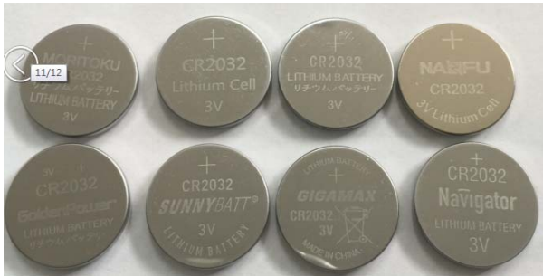
Cell/电芯 (CR2032 3,0V 220mAh)