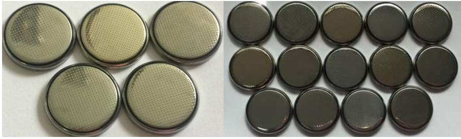
Cell/电芯 (CR2032 3.0V 220mAh)