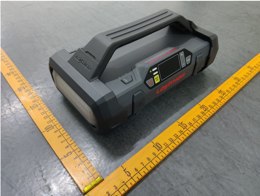
Figure 2 Overall view II of cell (外观图II)