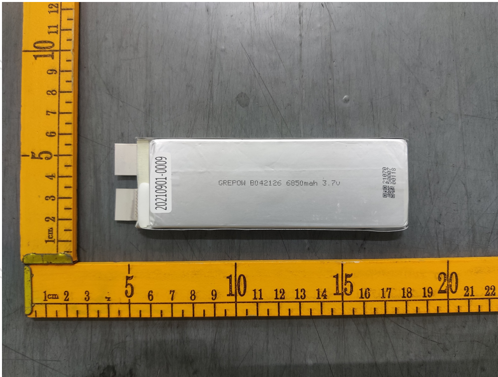
Figure 3 Overall view I of cell (电芯图)