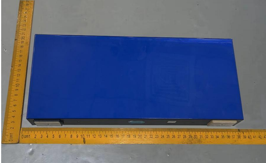
Figure 3 Overall view of cell (电芯外观图)