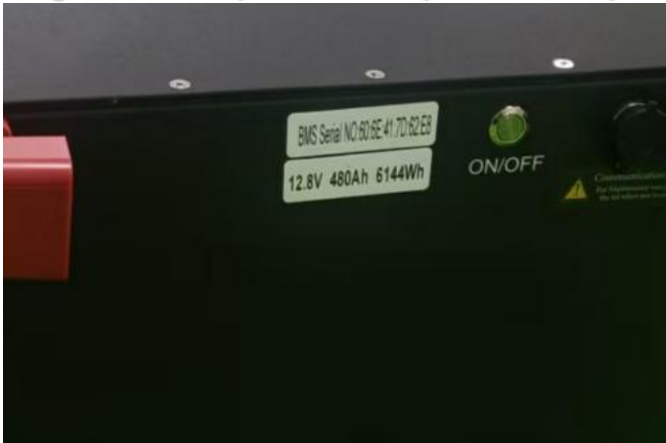
Figure 4 Battery label (电池标签)