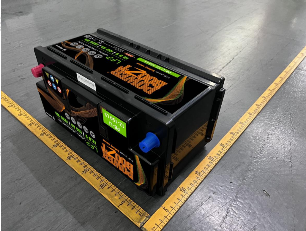
Figure 1 Overall view I of battery (外观图I)