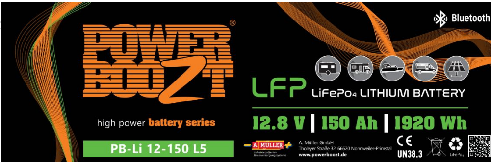
Figure 4 Battery label (电池标签)

Address: Landing Testing Building, No.18 Center Road of Yayuan Industrial Zone, Nancheng District, Dongguan, Guangdong, China.